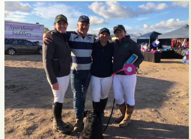
Half of the 2 Teams represented here!